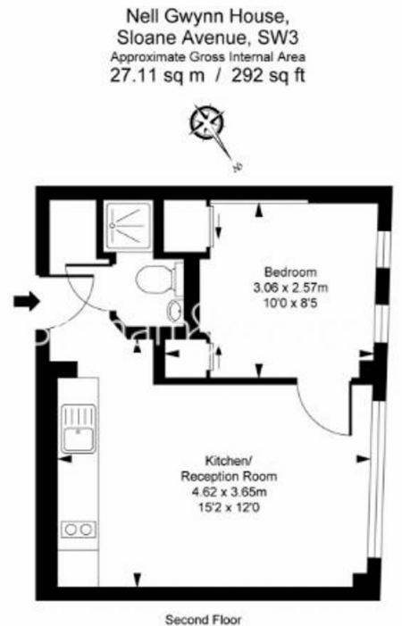
ILLUSTRATION FOR IDENTIFICATION PURPOSES ONLY ALL MEASUREMENTS ARE MAXIMUM AND INCLUDE WINDOW SAYS AND SHROTTIDES WHERE APPLICABLE THIS PLAN MUST NOT BE REPRODUCED BY ANY OTHER PERSON WITHOUT PERMISSION