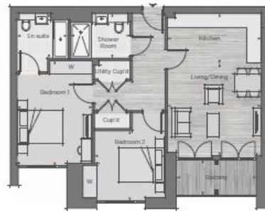
2 Bedroom Apartment