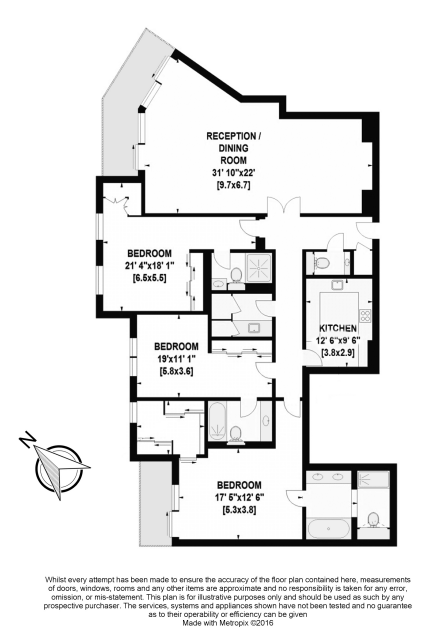
2nd Floor Approx gross internal area: 1920sq/ft - 179sq/m

£1,569 per week, £6,799 per month + fees