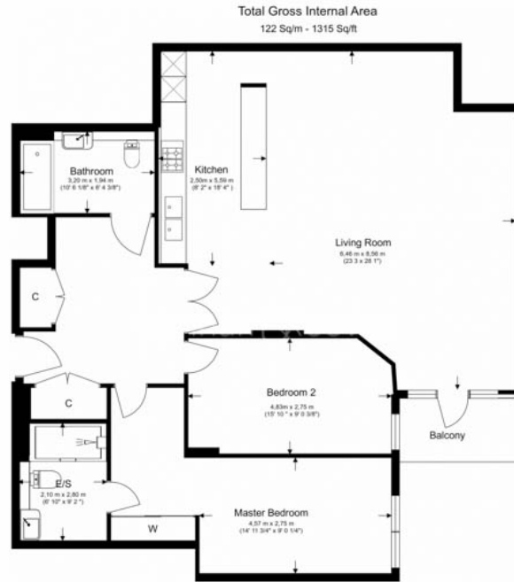
Floor Plan measurements are approximate and are for illustrative purposes only. While we do not doubt the floor plans accuracy, we make no guarantee, warranty or representation as to the accuracy and completeness of the floor plan.